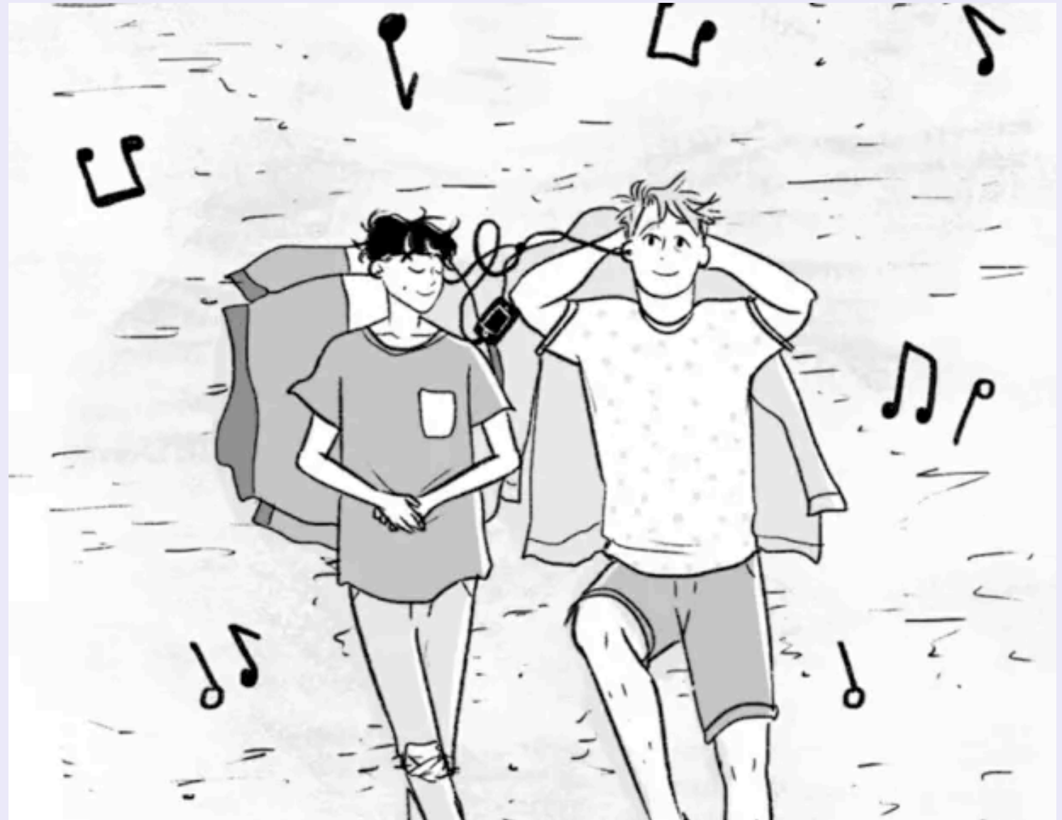
Fig 8. Alice Oseman. “Heartstopper.” Self-published. Print: Hachette Children's Group. (2019.)