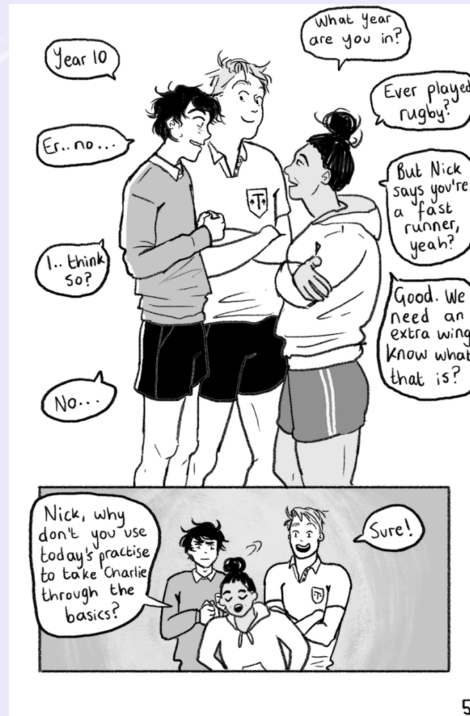
Fig 2. Alice Oseman. “Heartstopper.” Self-published. Print: Hachette Children's Group. (2019.)