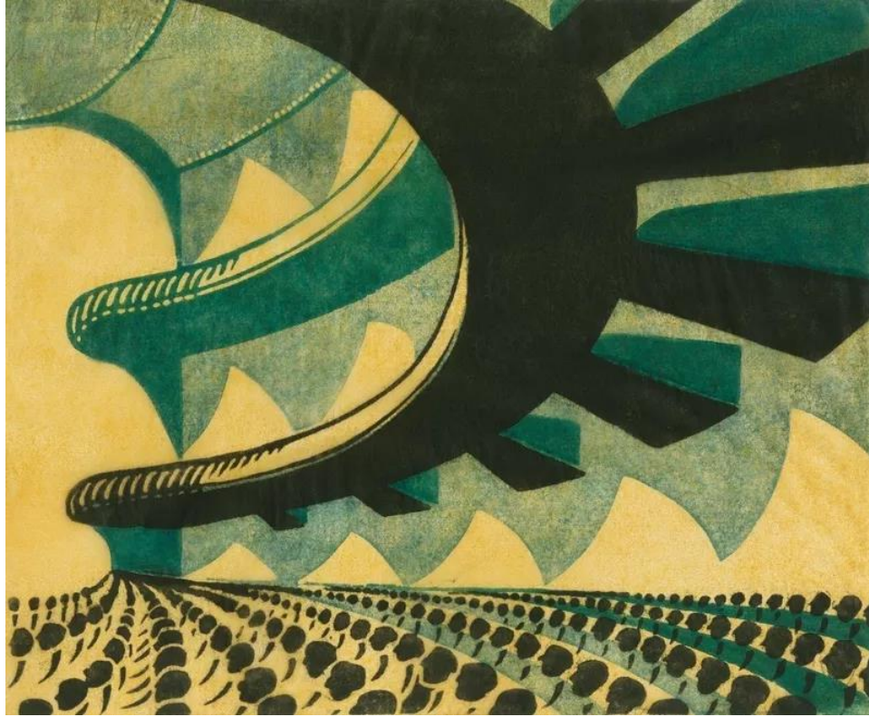
Sybil Andrews, Concert Hall, 1929

Andrews is an English Canadian artist known for her modern printmaking technique in artwork. I have chosen the concert hall as my favourite print artwork as it immediately caught my eye. The shapes, shadows, precise design and structure, all hand-cut through Lino print, fascinates me. This piece is of the London Queens' Hall, a place filled with classical music and acoustics, printed with a cold colour pallet, with different shades of blue to enhance the shadows of the balconies and human figures seated in the tightly spaced grand circle. Lastly, this print shows Andrews' interest in architecture and its depiction in a linocut print technique.