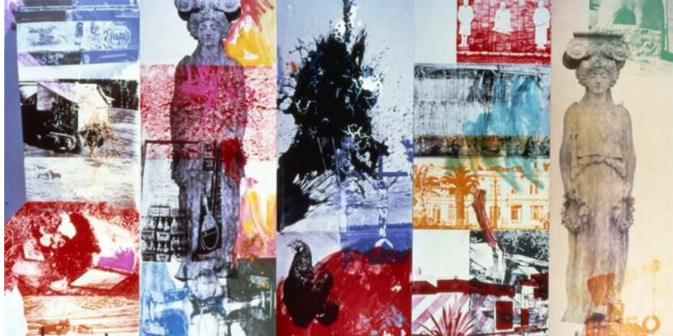
Robert Rauschenberg, ROCI, 1987

Robert Rauschenberg, an artist born in Port Arthur, Texas, is well known for his artworks, made up of found objects and assemblage pieces. A well-known assemblage of his, 'ROCI', caught my eye, intriguing me through its diverse colour palette and found imagery. As I looked deeper into the composition, I discovered that the artist uses collage to portray positive social change and to show his dedication to human rights and creative expression. It notes that this piece is named after his pet turtle Roci, further indicating how the artist uses his wild artistic portrayal to individualize his works of art.