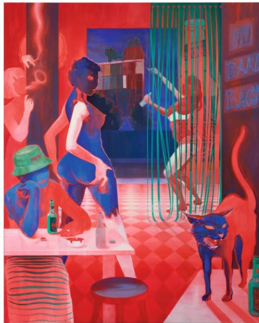
Fig. 1 Lisa Brice, No Bare Back, After Emba, 2017

I find this piece visually intriguing the more I look, 'no bare back' by Lisa Shaw is an inciting and provocative piece about the female form. The main point I appreciate that Lisa brings forward is how the females in her artworks are uninterested in how they appear to those around them, provoking the male gaze. Lisa herself mentioned that the women she draws assert their dominance through drinking 'manly beer' or partaking in smoking, reversing the idealized standard of women. This bright colour is a visual representation of the women, matching their intriguing display and seductive postures.