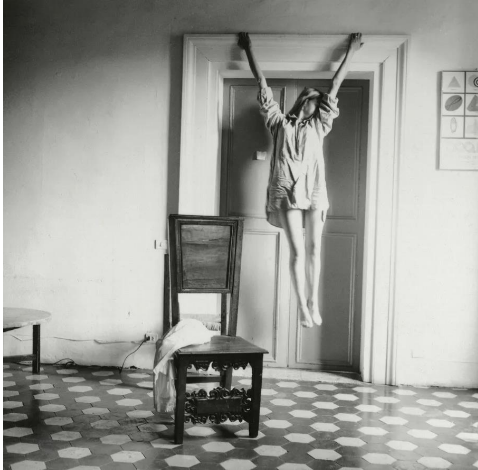
Francesca Woodman, Untitled, 1977-1978

Francesca Woodman is an American photographer who has inspired me through long exposure shots with distorted and mutated anomalies. Woodman's work encompasses the use of ghost-like entities, otherwise seen as angels by historians. The use of shutter speed allows the forms to appear frozen yet in motion at the same time. Her distraught poses, paired with longing and almost pained expressions, have left a lingering sadness in each image. A lot of her works were created while she was a student, still exploring her artistic capabilities and Francesca is now known to be a successful modernist photographer.