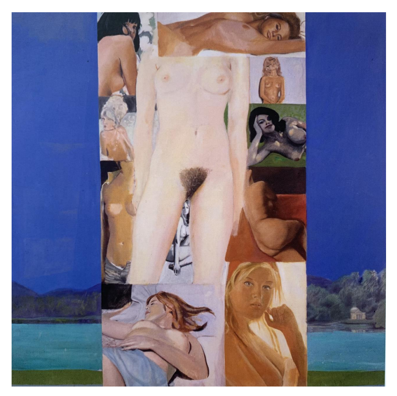
Pauline Boty, It's A Man's World II, 1965.