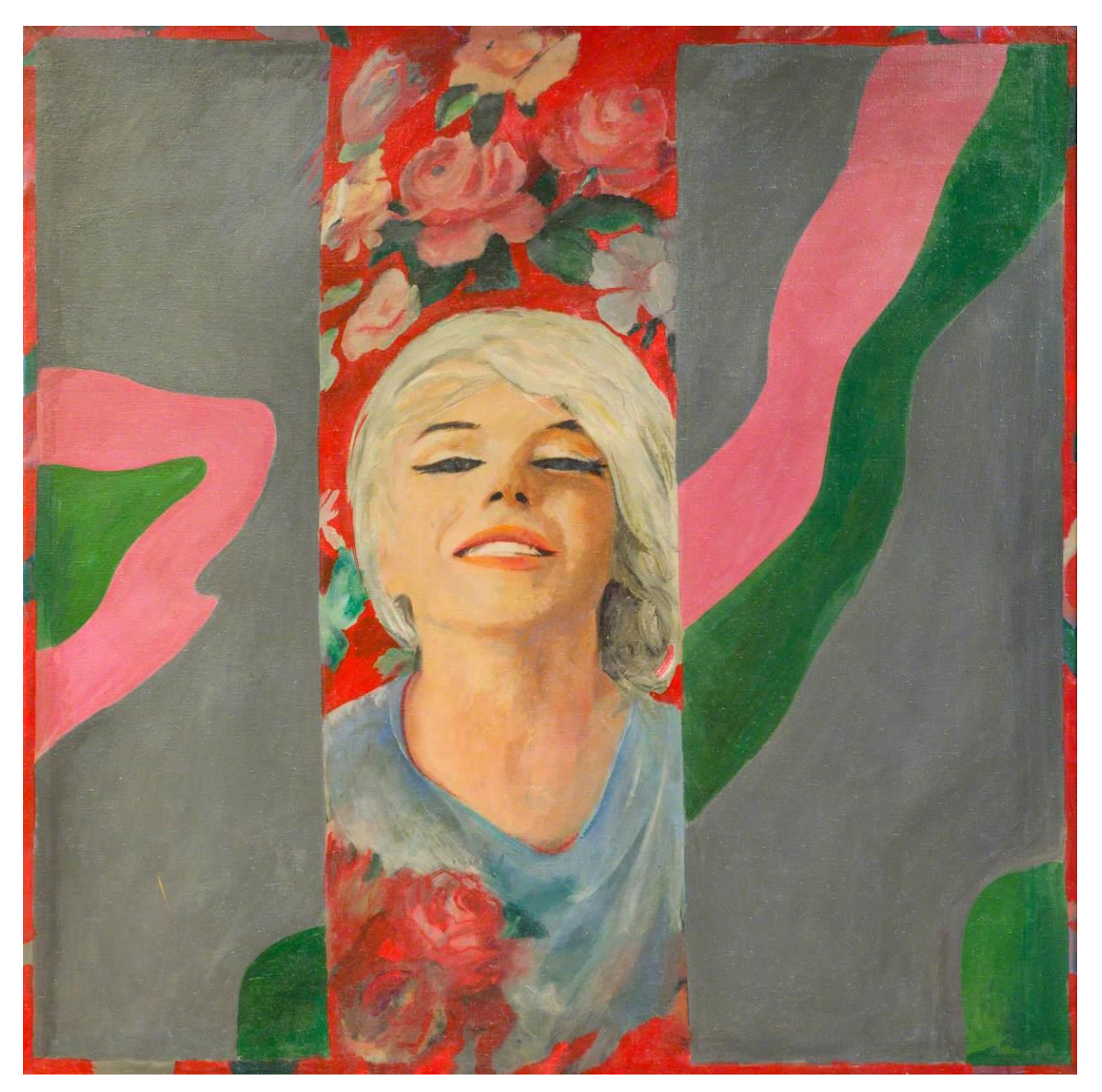
Pauline Boty, Colour Her Gone , 1962.